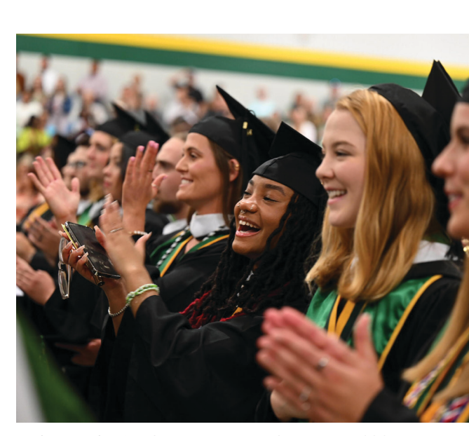
Undergraduate Commencement Ceremony 2023

Fri.-Sun. Information: mcdaniel.edu/ alumniweekend2024