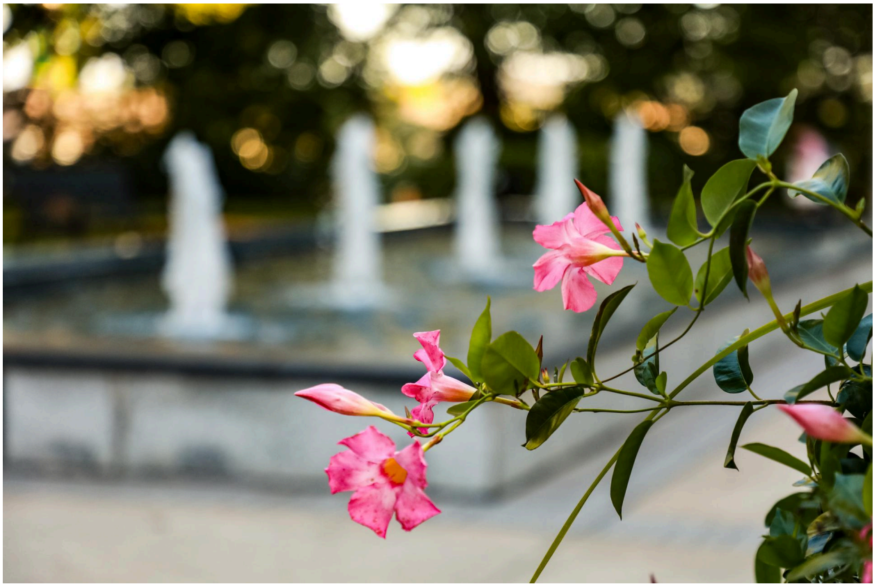
Flowers in front of the fountain in McTeer-Zepp Plaza.