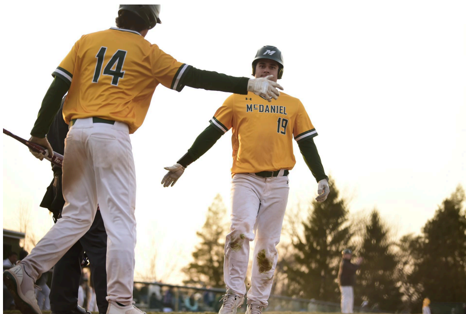
McDaniel baseball players congratulating each other.