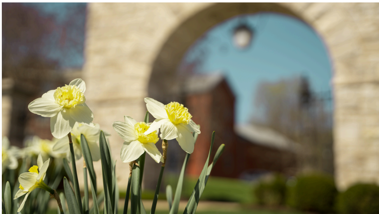
Daffodils in front of Ward Memorial Arch.

We hope everyone is having a good May and that you're ready for your student to return home. If this is your first time having a college student return after living away for a year, please know that it is normal to experience a "readjustment period." There's a good chance that the summer will feel different for life at home. They have lived independently for a while and may have developed new habits, hours of operation, etc. There are many (trust us ... MANY) articles available online about this period. If you're up for some reading, check out this article!