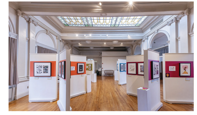
Esther Prangley Rice Gallery

5 McDANIEL COLLEGE · SPRING 2023 SPRING 2023 · McDANIEL COLLEGE 6