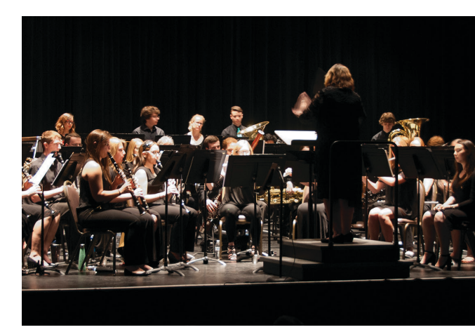
Westminster Symphony Orchestra

Sat., 3 p.m. Scott Center, Carroll Community College, 1601 Washington Rd., Westminster Information: 410-857-2599