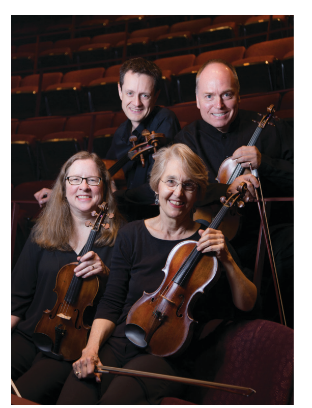
The Left Bank Quartet performs March 12

Sun., 3 p.m. Scott Center, Carroll Community College, 1601 Washington Rd., Westminster Ticket information: facebook.com/CMOTH